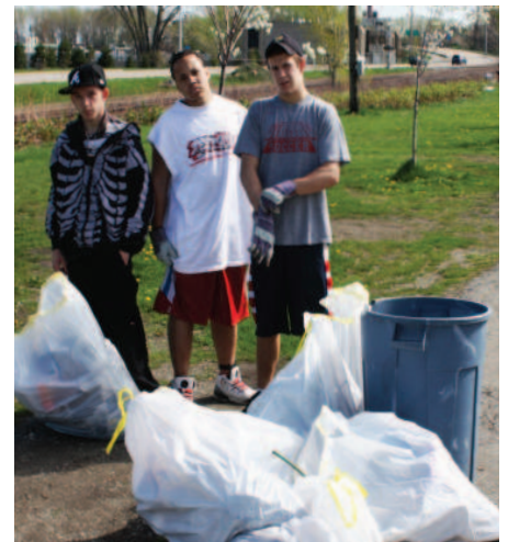
Good Neighbors and Volunteers at the Annual Beauty & the Bluff spring clean up, May 2nd.

Invite your neighbor over for a leisurely cup of coffee to discuss any problems you may have, or to share good news.